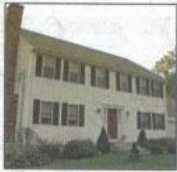
Plenty to enjoy inside and out at 91A Prospect Hill. ▶ 18