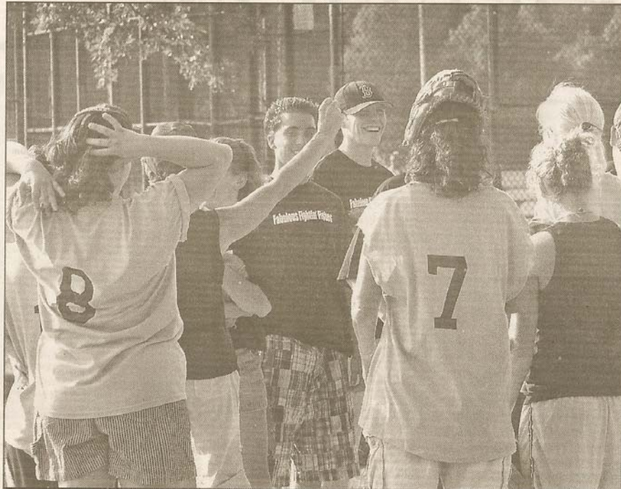
A good time was had by all during the Peabody Properties softball season.

Peabody Properties Inc.'s portfolio includes The Residences at LeBaron Hills Country Club in Lakeville.